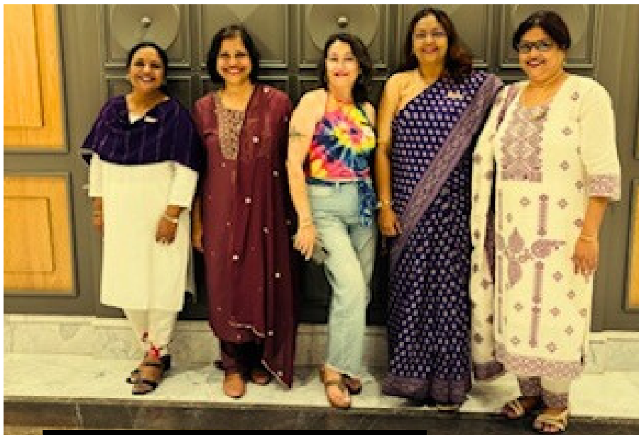
MANAGING COMMITTEE 2024-2025